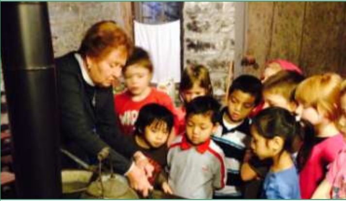
Des Moines Adventist School students on a tour.