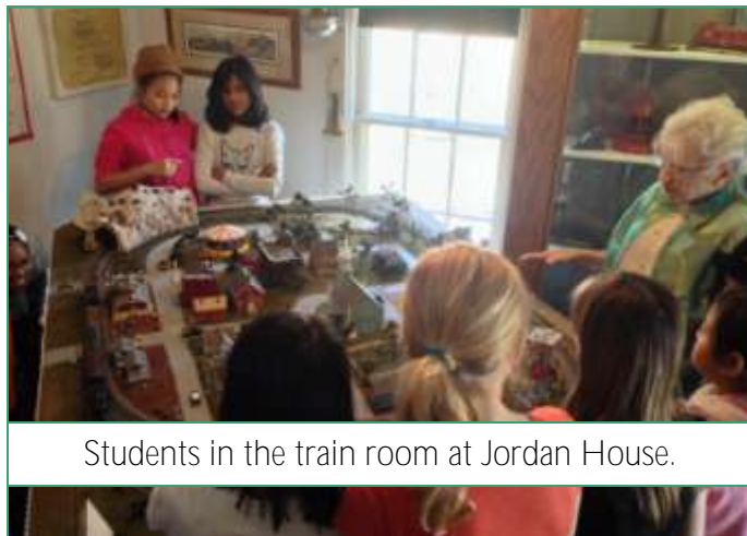
Students in the train room at Jordan House.

*Subject to availability and WDMHS discretion.