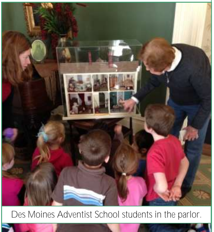
Des Moines Adventist School students in the parlor.

As the West Des Moines Historical Society has started to bring in additional visitors and school groups, our need for volunteer tour guides has grown. These volunteers would be asked to help lead group tours on an as-needed basis. If you or someone you know would be interested in helping us to meet this need, please email us at wdmhs@valleyjunction.com .