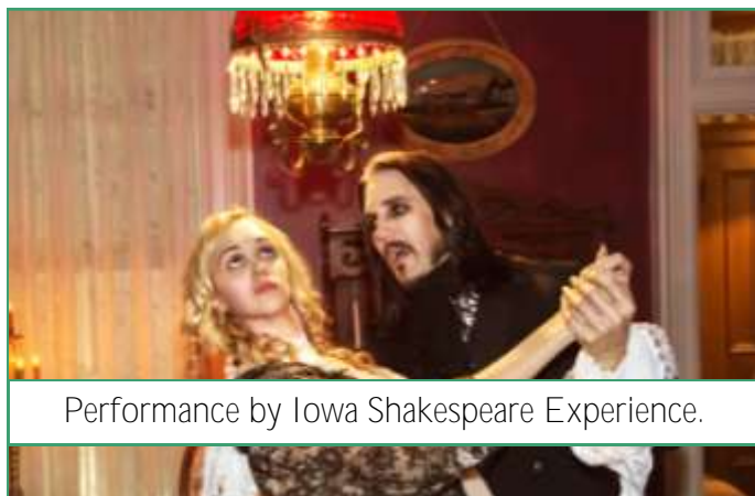
Performance by Iowa Shakespeare Experience.